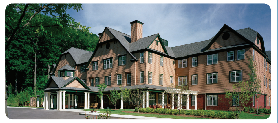
Westport Senior Center