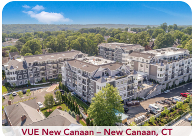
VUE New Canaan – New Canaan, CT