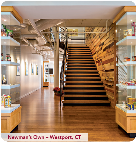
Newman's Own – Westport, CT

We have expertise in multifamily housing, mixed-use developments, senior living facilities, historic structures, and subsidized residential units. Each project has been unique and presented specific construction, scheduling, or logistical challenges. Projects have been completed in both urban and suburban locations and have included parking structures, elevators, lobbies, fitness centers, courtyards and gardens, conference facilities, and retail spaces. We have extensive experience with high-end finishes, intricate millwork applications in wood, metal, stone, and synthetic materials, as well as highly sensitive mechanical systems and complex lighting arrangements.