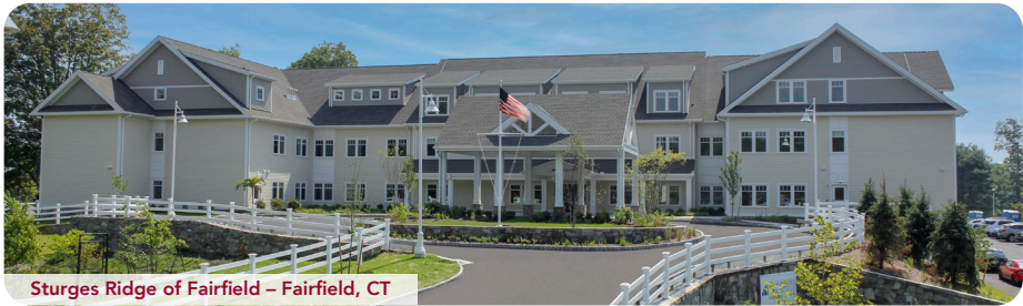
Sturges Ridge of Fairfield – Fairfield, CT