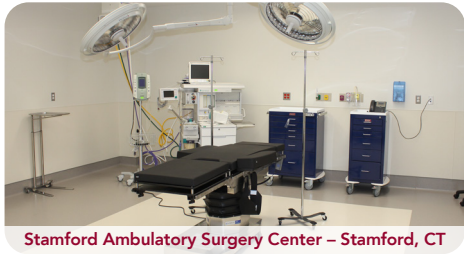
Stamford Ambulatory Surgery Center – Stamford, CT