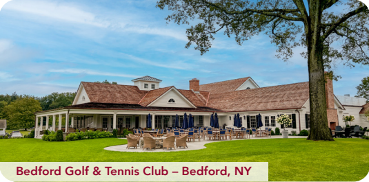
Bedford Golf & Tennis Club – Bedford, NY

We have completed a broad range of private clubs projects from new, out-of-ground structures to renovations, as well as additions and alterations to occupied facilities which require complex organizational and scheduling skills to ensure the safety of employees and club members with a minimum of disruption. We have completed projects ranging from capital improvements less than 2,000 square feet to out-of-ground clubhouses over 60,000 square feet. Projects have included dining facilities and kitchens, pools, tennis and squash courts, and locker rooms, as well as new roofs, high-end custom finishes, maintenance facilities, and sophisticated mechanical systems.