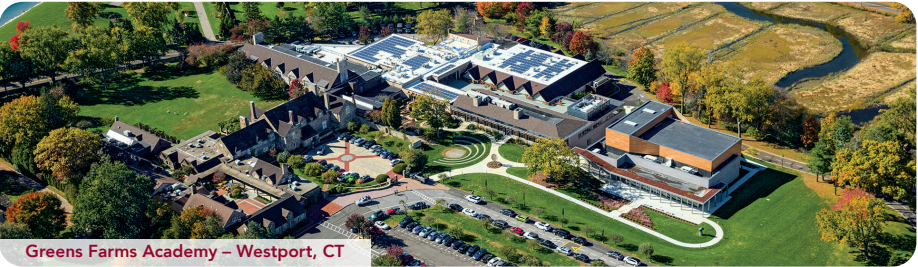
Greens Farms Academy – Westport, CT