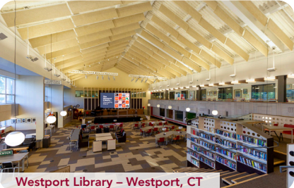
Westport Library – Westport, CT

Our experience in the healthcare market includes hospital renovations, outpatient care facilities, new medical office buildings, and housing for the elderly with special needs. Working within an operating hospital requires specific organizational and construction skills. We have completed projects ranging from less than 2,000 square feet to over 50,000 square feet including intensive care units, operating rooms, clinical laboratories, cardiovascular and post-anesthesia care units, central processing areas, diagnostic imaging, rehabilitation, diabetes, orthopedic, and family practice walk-in facilities. Our experience with the complex tasks of performing major renovations in existing or new medical facilities allows us to fully understand the requirements for patient safety, systems integrity, facilities management, and protection of ongoing medical operations.