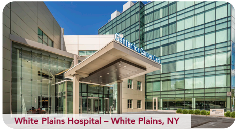
White Plains Hospital – White Plains, NY