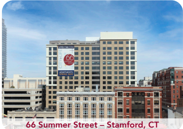
66 Summer Street – Stamford, CT

We have expertise in multifamily housing, mixed-use developments, senior living facilities, historic structures, and subsidized residential units. Each project has been unique and presented specific construction, scheduling, or logistical challenges. Projects have been completed in both urban and suburban locations and have included parking structures, elevators, lobbies, fitness centers, courtyards and gardens, conference facilities, and retail spaces. We have extensive experience with high-end finishes, intricate millwork applications in wood, metal, stone, and synthetic materials, as well as highly sensitive mechanical systems and complex lighting arrangements.