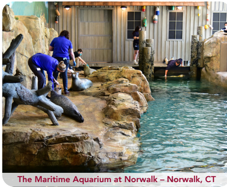
The Maritime Aquarium at Norwalk – Norwalk, CT