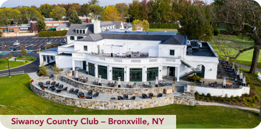
Siwanoy Country Club – Bronxville, NY