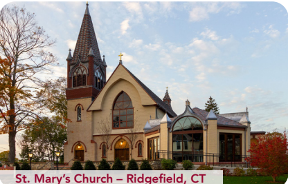
St. Mary's Church – Ridgefield, CT