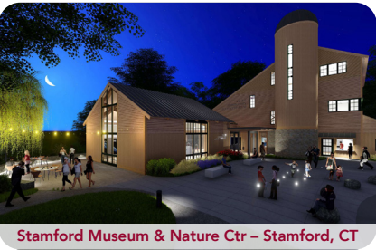
Stamford Museum & Nature Ctr – Stamford, CT