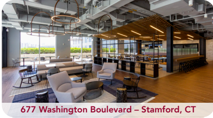
677 Washington Boulevard – Stamford, CT