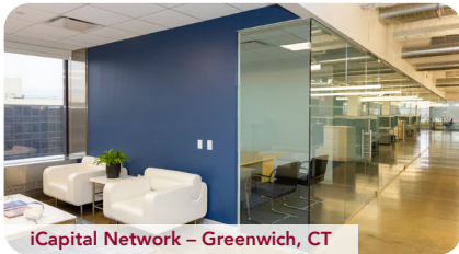
iCapital Network – Greenwich, CT

We have completed a broad range of projects to assist building owners with capital improvements to upgrade their facilities and improve their leasing that include exterior façade changes, plazas & entry canopies, cafes & kitchens, lobbies, corridors & restrooms, pre-builds & white boxes, mechanical & electrical systems upgrades, custom millwork and roofs. We have also worked with tenants on projects ranging from minor improvements in occupied spaces to planning and construction of new offices including complex trading floors, reception areas, conference facilities, open seating spaces, huddle areas, staircases, and pantries.