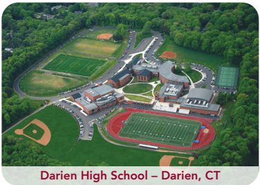
Darien High School – Darien, CT