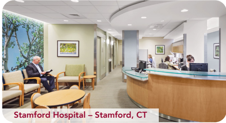
Stamford Hospital – Stamford, CT

We have extensive experience working on a variety of special structures including municipal facilities, houses of worship, national and local nonprofit organizations. We are adept at working with building committees for these organizations and assisting them in meeting their design and construction goals through extensive preconstruction services, creative logistical and phasing plans, and budget controls.