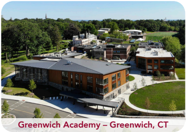
Greenwich Academy – Greenwich, CT

We have experience with both public and private educational facilities. Projects include facilities for day care, elementary, middle, and high schools, as well as higher education. Construction has encompassed both new structures and renovations to occupied facilities and ranged from upgrades to specialty rooms to an entirely new 325,000 square foot high school. We have also completed athletic facilities, libraries, auditoriums, and site improvements. Our extensive expertise working in occupied schools, and planning and implementing programs ensures student safety and the protection of ongoing school operations.