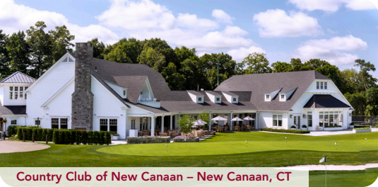
Country Club of New Canaan – New Canaan, CT