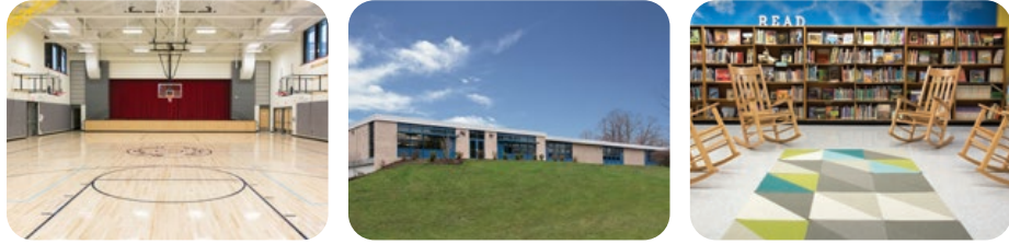
Naramake & Rowayton Elementary Schools Norwalk, CT